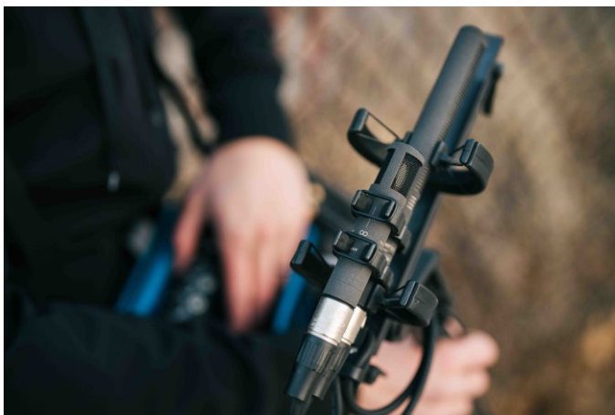
The Sennheiser MKH 8030 and MKH 8060 RF condenser microphones in an MS stereo set-up

The rugged MKH 8000 RF condenser microphone series for sophisticated audio capture will also be on show, as will be Sennheiser's updated broadcast headset portfolio, which covers the needs of commentators, broadcast engineers and camerapeople alike.