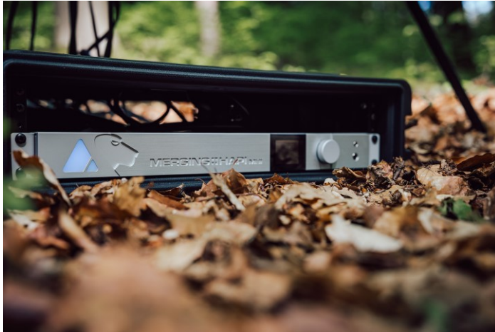
At IBC, Merging will show new hardware upgrades

the device to be customized for these typical use cases. On top of that, Merging will also unveil upcoming upgrades with additional network options.